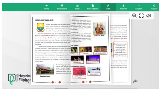
Figure 3. Mode Display after Revision