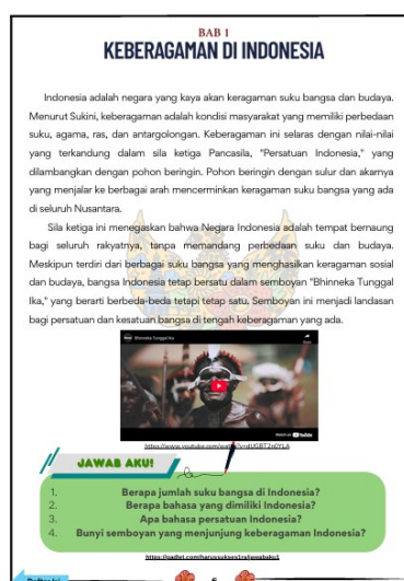
Figure 4. Front Page Display of Teaching Materials Before Revision