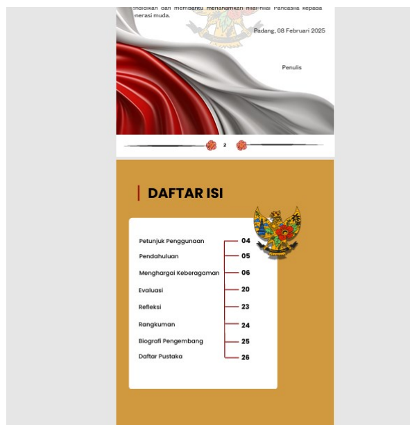
Figure 2. Mode Display before Revision