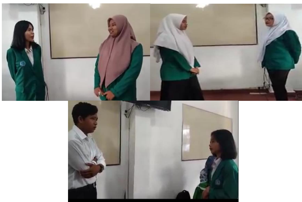
Figure 4. The photograph of Post-Test situation

Here, the researcher explain the material about the daily activity by using Think Pair Share Technique. Then, the researcher divided some students into some group.