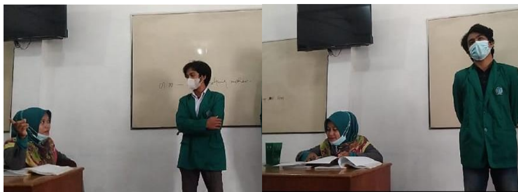
Figure 2. The photograph of Pre-Test situation

The mean of students' score in the Pre – Test was 51.69. The mean of students' score in the Cycle 1 was 65.17 and the mean of students' score in the Cycle 2 was 74.81. We can see, There is an improvement in every cycle.