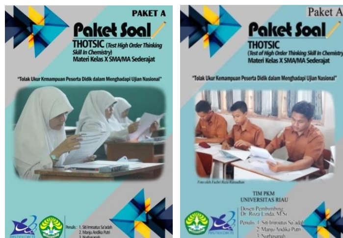
Figure 2. Before and after THOTSIC

The analysis of the reliability level of the THOTSIC question was 0.62, it was categorized as high category. The level of difficulty of the problem was 0.3, it was included in the difficult criteria. The differentiator of multiple choice questions was 0.39. Based on the criteria of differentiation, D_p \geq 0.3 = the question is accepted.