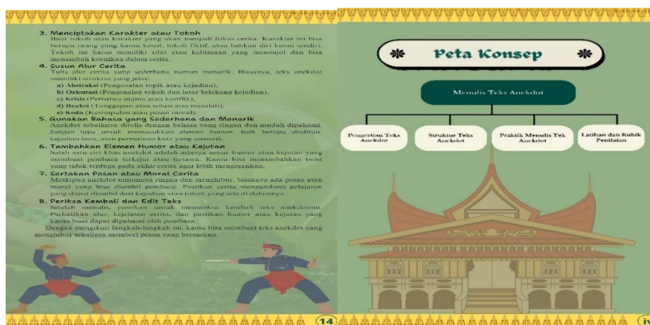
Figure 2. Module

In general, the product is good, but there needs to be changes such as the print results. The print results need to be improved so that the appearance and coloring are more attractive. The validator suggests that the module be printed in the form or using a spiral, not in the form of a regular book, and it is recommended to use paper with a quality of 80 grams. Thus, the module can be used with a little revision. The following is a Summary Table of Validation of Media for Developing the Anecdotal Text Writing Module Assisted by Stand-Up Comedy. Recapitulation of Validation of Media for Developing Anecdotal Text Writing Module Assisted by Stand-Up Comedy for Grade X Students of Madrasah Aliyah (MA) can be seen in table 7.