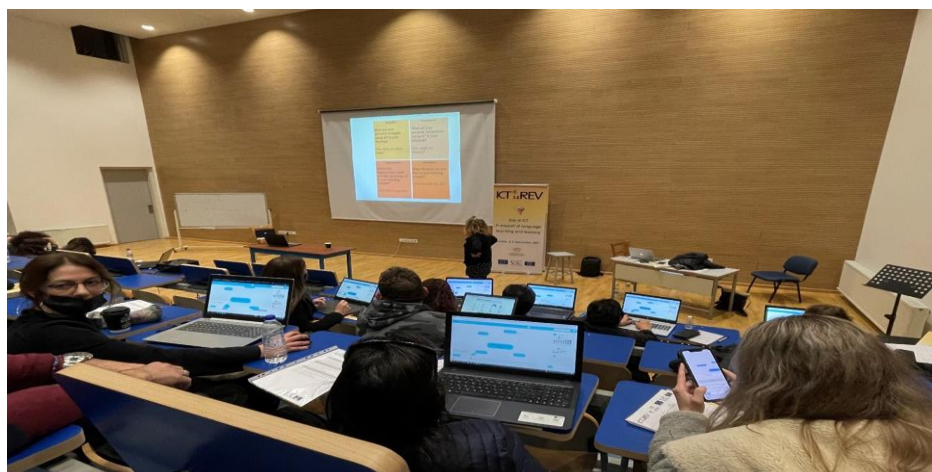
Figure 1. ICT integration for Teacher in Training.