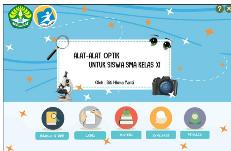
Figure 1. Lectora Inspire kerja work page display