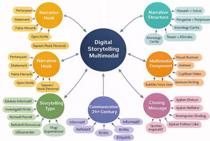
Figure 3. NVivo Summary Node – Multimodal Storytelling Digital Dimension Relationship Mapping

The results of the NVivo analysis, through the axial coding process, show that digital creators tend to use relatively systematic narrative structures. The relationships between various narrative elements in digital storytelling are illustrated through the NVivo node summaries, as shown in Figure 3. This visualization reveals that elements such as the introduction, explanations, the climax of the story, and the concluding message are all interconnected, thereby creating a coherent narrative flow. Based on the axial coding analysis, five dominant narrative structures were identified. These are summarized in Table 3.