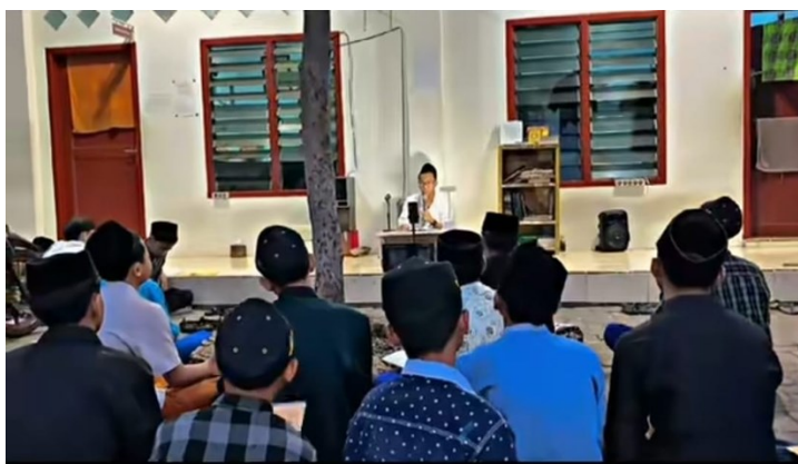
Figure 1. A religious study session led by a cleric at the Salafiyah Dawuhan Islamic Boarding School, broadcast via digital media.

These findings show that TikTok is used not only for content dissemination through short videos but also for interactive learning through live streaming. A religious study session is conducted through the live streaming feature, allowing the ustaz to deliver learning not only to students but also to alumni and the wider community who join the session via the TikTok application. This interactive feature shows that the learning process is not one-way, but enables two-way communication between the ustaz and the audience. The implementation of this activity is presented in Figure 1.