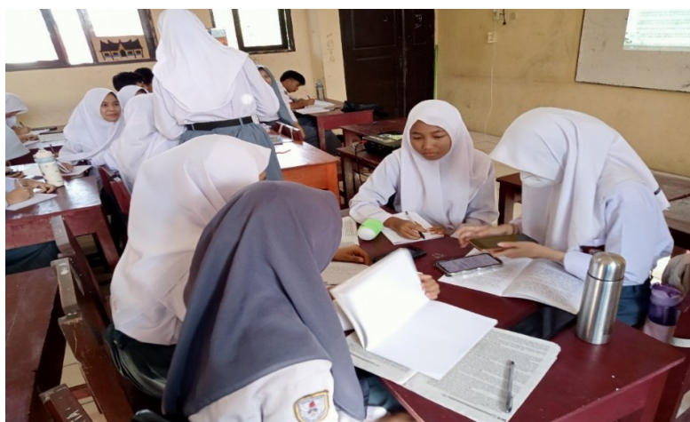
Figure 2. Teaching and learning conditions in Class XI F at Palu State Senior High School 4

also come from Donggala Regency. In general, classroom conditions at SMA Negeri 4 Palu are good and conducive to learning. Classrooms are neatly arranged, with adequate lighting and ventilation to support student comfort during teaching and learning activities. In addition, supporting facilities such as tables, chairs, blackboards, and learning media are also well available. During the learning process, the classroom atmosphere is quite active because teachers apply learning methods that encourage student participation, such as group discussions, question and answer sessions, and project activities. The interaction between teachers and students is good, creating a more communicative and collaborative learning atmosphere. These conditions also support the implementation of the Merdeka Curriculum and the Pancasila Student Profile Strengthening Project (P5) activities, which emphasize cooperation, creativity, and critical thinking skills among students, as can be seen in Figure 2.