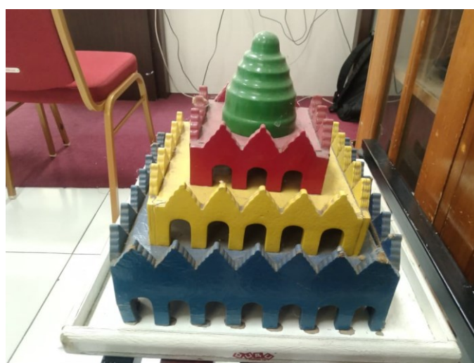
Figure 3. Pancasila Student Profile Strengthening Project Activities

“When it comes to projects, they are also responsive. The results are maximized because of group work. There is also independence, such as making their own clippings.” Can be seen in figure 3. (Interview, November 16, 2024)