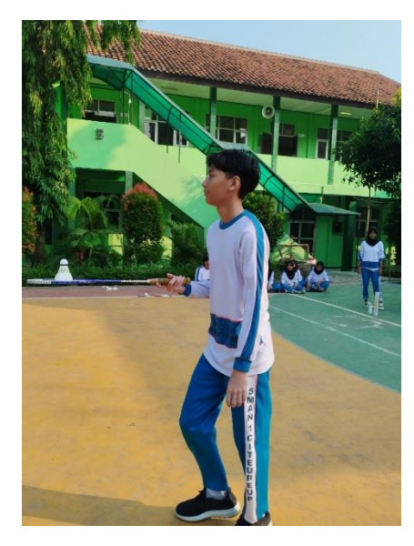
Figure 3. 2nd Mini-Game