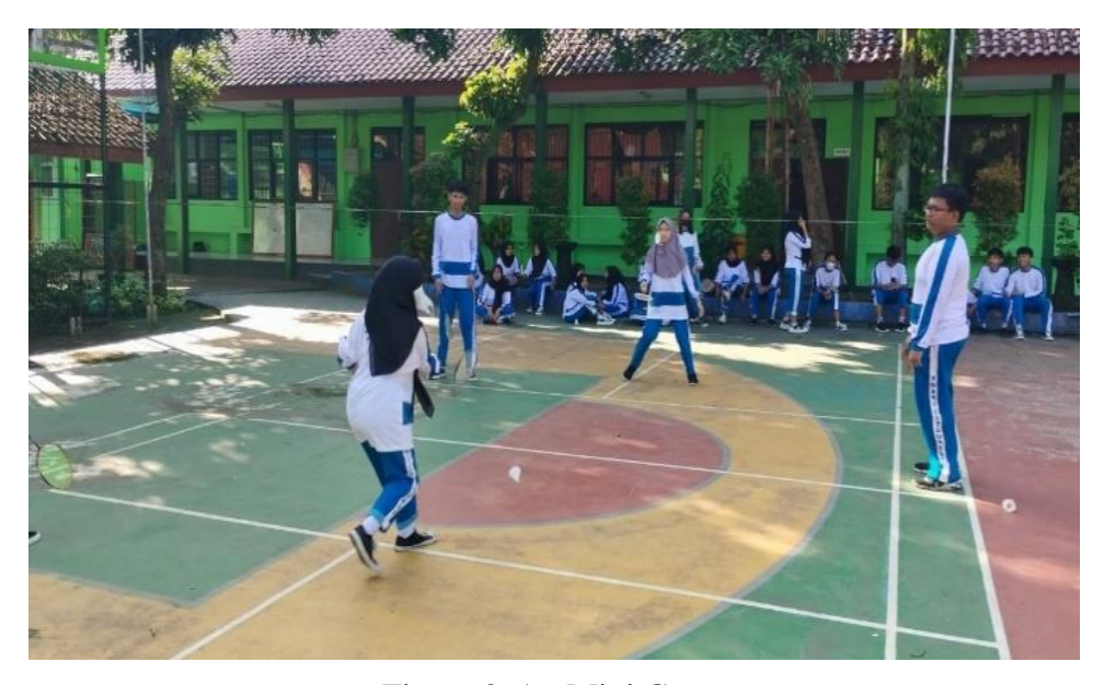
Figure 2. 1st Mini Game

While the activities carried out during the research process are divided into eight meetings where every two meetings will discuss one basic technique and at the last meeting a post-test activity is carried out. and in the learning process includes several games that are in accordance with the sport to be studied in this case badminton. Figure 2 shows students playing a game where the game has a rule that each player is prohibited from using the smash technique in the game.