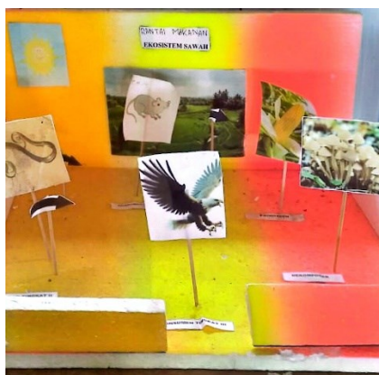
Figure 1. Visual Media Food Chain Diorama

and game activities, such as grouping the roles of living things in an ecosystem, or guessing whether a picture includes a producer, consumer, or decomposer. Student-centered learning is characterized by the ability to vary learning activities using various appropriate strategies depending on the student's situation (Barokah et al., 2024). The habit of categorization through varied learning strategies encourages students to identify relevant categories so that the learning process is more meaningful and supports their interpretation skills.