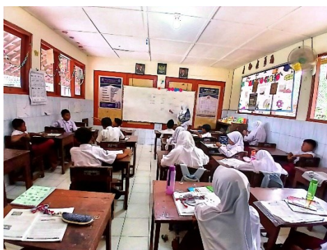
Figure 3. Review Activities

Providing feedback in the form of explanations encourages students to clarify and restate the meaning of concepts that they do not yet understand. Interviews with teachers supported by students showed that during classroom learning, teachers provided explanations through different approaches. For example, in teaching about food chains, teachers explain the relationship between rice, mice, snakes, and eagles using examples that relate to students' experiences. To clarify the explanation, teachers draw the food chain on the blackboard so that students can more easily understand the ecosystem, as shown in Figure 3. The importance of re-explanation strategies and the use of interactive media to reduce student misconceptions (Rahma et al., 2025). Providing feedback with re-explanations and the use of appropriate media helps the process of clarifying meaning, thereby overcoming misconceptions and deepening understanding of learning concepts.